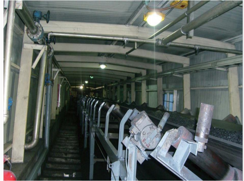
Coal Handling Belt Corridor